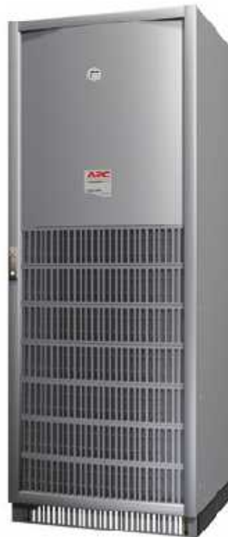
MGE Galaxy 5500 Battery Cabinet