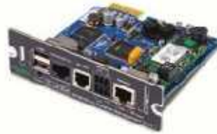
Schneider UPS Network Management Card 2 with Environment Monitoring, Out of Band Access and Modbus