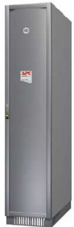
MGE Galaxy 5500 Transformer 80kVA-120kVA Standalone Cabinet