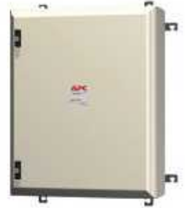
MGE Galaxy 5500 External Bypass Wallmount