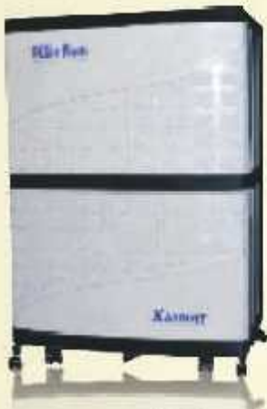
KNIGHT (Double Trolley)