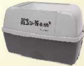
STURDY (Single Trolley)

•X r :-DStylish yet sturdy, the Su-Kam'sTar balue Trolley is made from Long Lasting PPCP plastic.