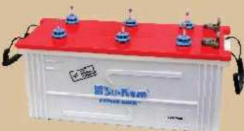
LEAD ACID (100Ah-200Ah)